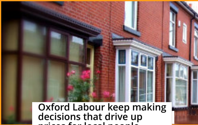
Oxford Labour keep making decisions that drive up prices for local people.

Local Lib Dems are asking for busses to take priority over LTNs. There are many older people and tradespeople carrying heavy equipment living here who need to drive. That's why any LTN should only go ahead if local people are on board. But for people who want to leave the car at home, we'd like them to have a regular, reliable bus for them to use.